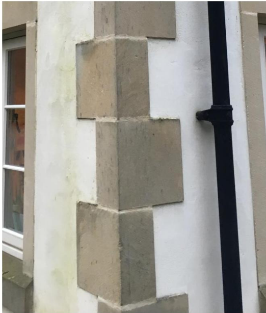
Figure 2- Existing extension

Walls – The walls will be constructed of rendered concrete blocks, the corners will have exposed stone to match the existing and surrounding buildings. The exterior will be rendered and painted with Weathershield York White to match the existing extension.