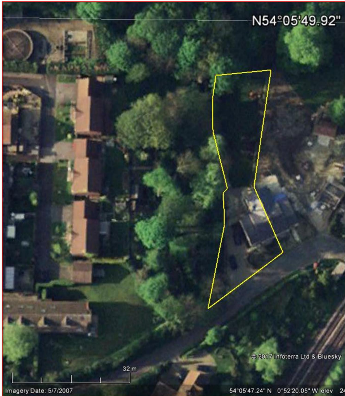
Figure1– 1:500 Site plan