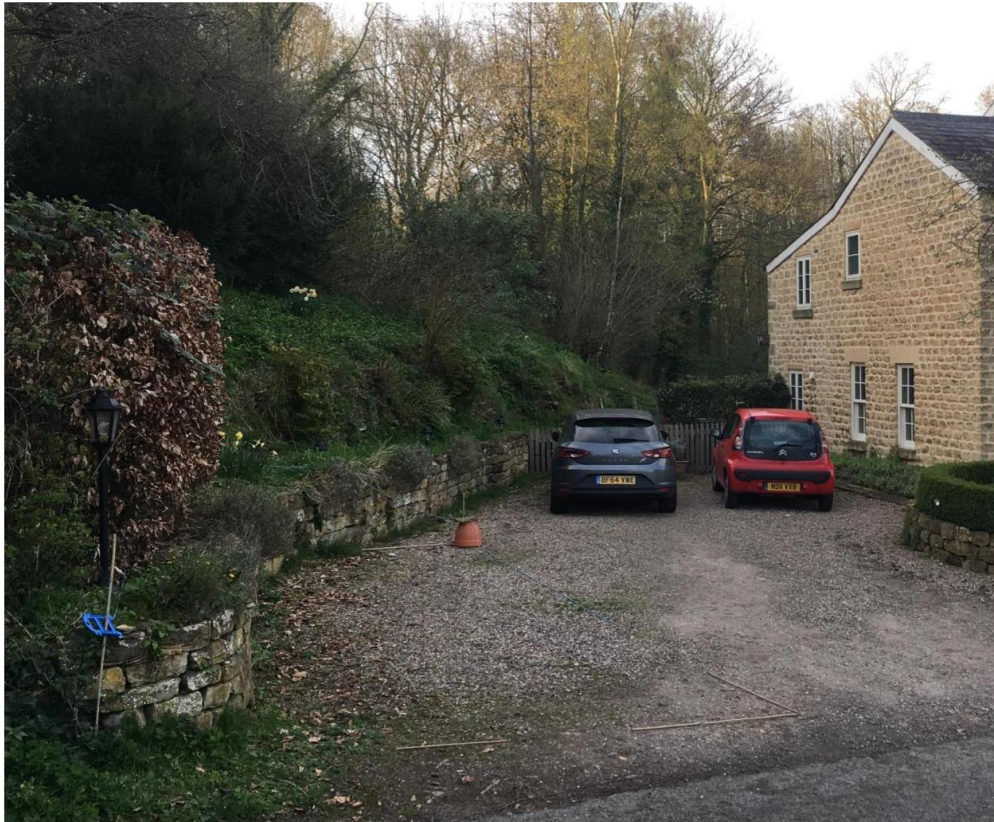
Figure 3- Existing driveway (Garage foot print indicated with bamboo canes)